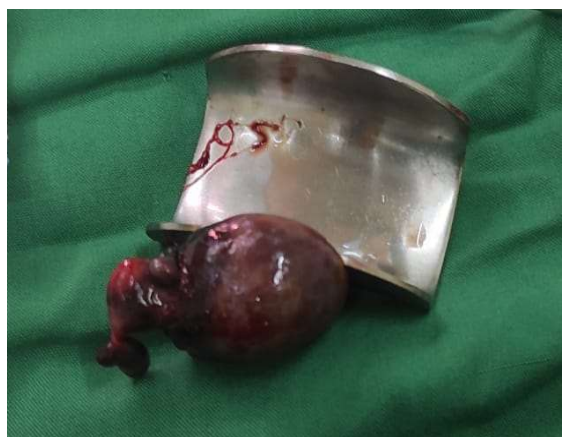
Figure 2: Abdominal retractor blade recovered during the laparotomy.

A gastroenterology review was done, and the decision to perform a diagnostic laparoscopy was upheld, following which the patient was referred to the gastroenterology clinic for further evaluation. An abdominopelvic ultrasound was requested and was found to be essentially normal. During laparoscopy, a foreign body (blade of a self-retaining retractor) was found adjacent to the left ovary and overlying the sigmoid colon. There was minimal fluid in the left paracolic gutter and a left ovarian cyst. Bilateral salpingectomy and left ovarian cystectomy were performed. A mini-laparotomy was performed to remove the foreign body (Figure 2). An incisional hernia and adhesions were noted on the anterior abdominal wall. Herniorrhaphy was performed, after which the abdomen was closed in layers. She progressed well postoperatively and was discharged on the second postoperative day.