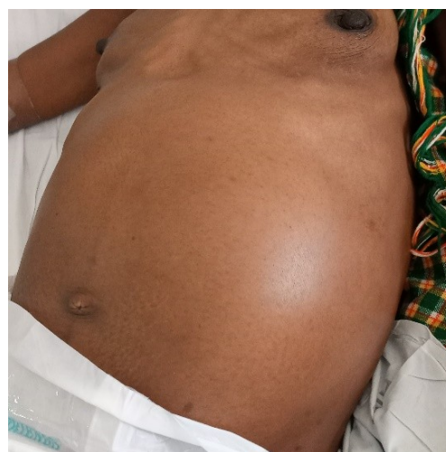
Figure 1: Massive abdominal distension due to a giant mass.

The patient was managed by a multidisciplinary team comprised of fetomaternal medicine specialists, gynecologic oncologists, general surgeons, urologists, interventional radiologists, and nutritionists. She was put on analgesics, antiemetics, intravenous fluids, and total parenteral nutrition, with a plan for ultrasound-guided biopsy of the mass for histopathological diagnosis and exploratory laparotomy. However, she was hemodynamically unstable. Her condition deteriorated, and subsequently arrested and succumbed eighteen days postadmission. During the postmortem, the fetus protruded from the vagina, with a crown-rump length of 10 cm. It was noted that she was expelled after resuscitative efforts. The abdomen contained peritoneal nodules and omental caking and an estimated 1500mls of straw-colored peritoneal fluid. The nodules had a cheese-like appearance. The lungs were edematous. The histological analysis of the autopsy specimen reported a tumor in the omentum, dispersed in sheets of pleomorphic lipoblastic cells and numerous mitotic figures. A histological diagnosis of metastatic liposarcoma was made.